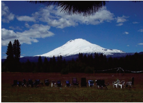
Mount Adams, ECETI Ranch, June 2010