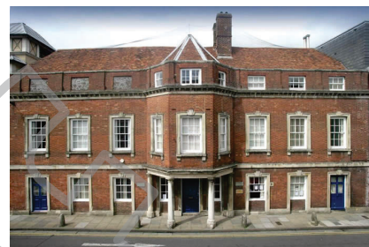
The Hall, 4 New St, Salisbury